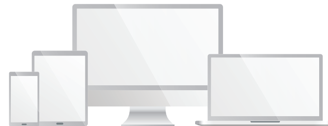
Smartphone, tablet, or computer